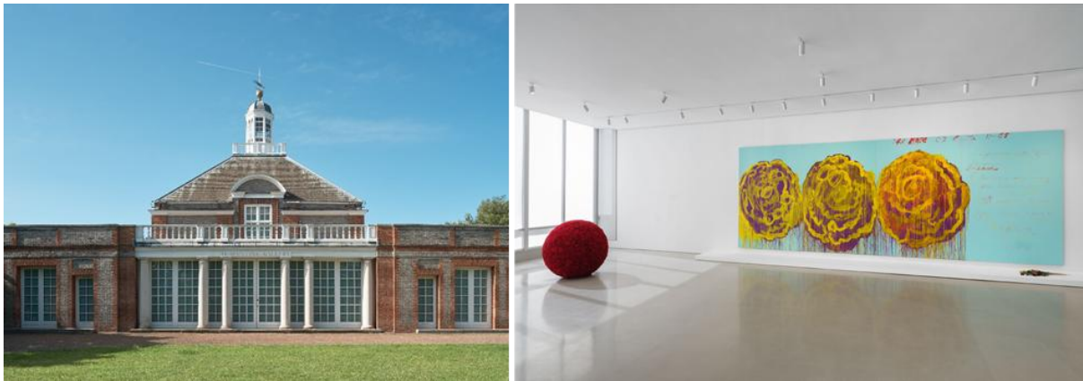
Image: Left: Serpentine. Right: The FLAG Art Foundation, 2025.

Serpentine and The FLAG Art Foundation announce major new transatlantic collaboration and launch the largest contemporary art prize in the UK