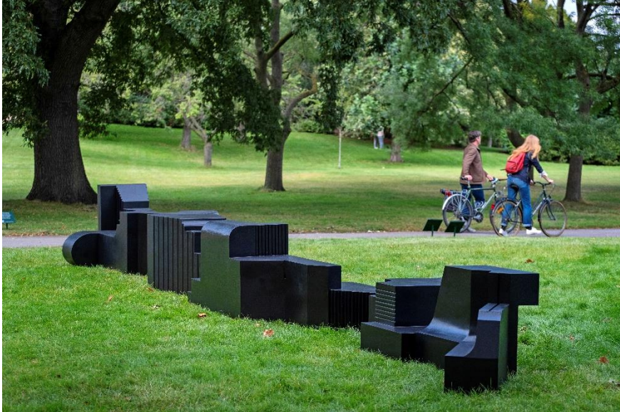
Fragment of Serpentine Pavilion 2021 for Frieze Sculpture Park, 2021.

Until Sunday 31 October Booking not required