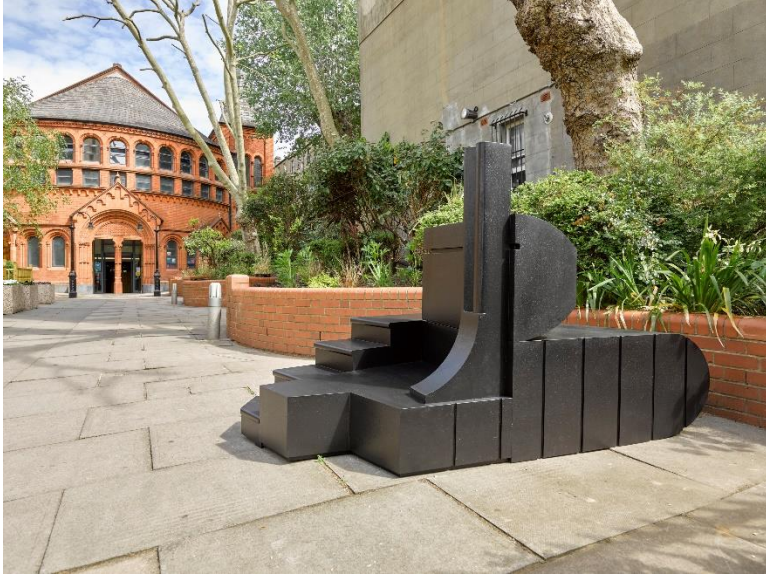
Fragment of Serpentine Pavilion 2021 designed by Counterspace for The Tabernacle

Sunday 10 October and Sunday 17 October 2021