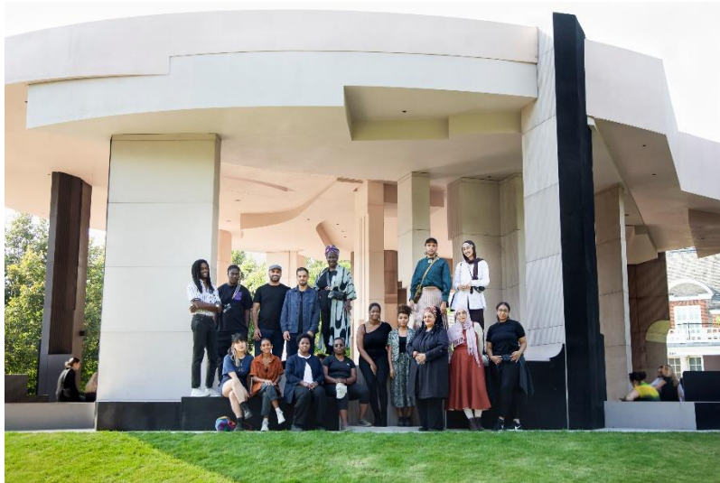
Support Structures for Support Structures 2021 recipients at the pavilion

Serpentine South Gallery Lawn Ending Sunday 17 October 2021 Booking not required