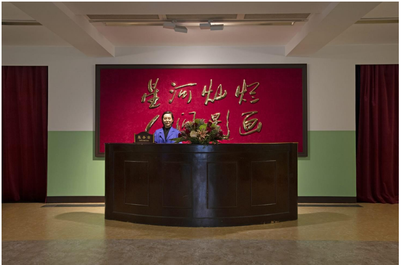
Cao Fei, Blueprints (Installation view, March 2020, Serpentine Gallery)

Press information and images serpentine.org/press