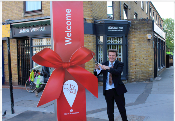
Official opening ceremony of the new Church Street Market signs by Westminster Council